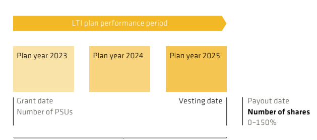
ROCE and relative TSR measurement

In the event of termination of employment, the unvested PSUs are forfeited except in case of retirement, disability, death, change of control, or liquidation. In the event of termination due to retirement or disability, the unvested PSUs vest at the normal vesting date, prorated for the number of months that have expired from the grant date until the termination date and based on the effective performance. In the event of a termination of employment due to death, liquidation, or a change of control, unvested PSUs are subject to accelerated vesting, prorated for the number of months that have expired from the grant date until the termination date and based on an achievement of 100%.