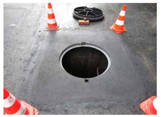
Finishing of Sika<sup>®</sup> FastFix-138 TT before it hardens.