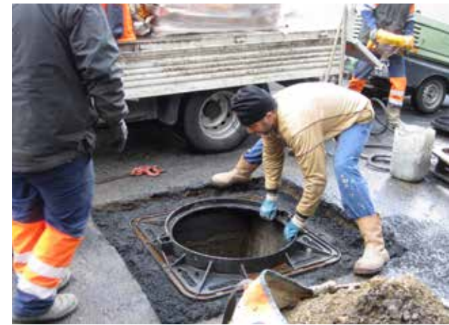
Placing Sika® FastFix-138 TT as a bedding mortar - mixed to a semi-dry consistency. Adjusting the final level of the manhole frame.