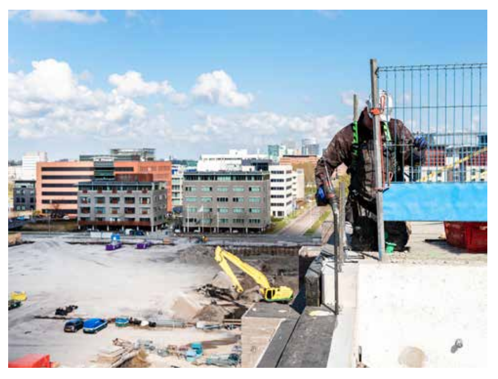
complexes will be constructed in rapid succession. One special detail of this major project is the exterior facade. It will be produced separately in a factory in Germany. A combination of classic and modern construction methods has been chosen.