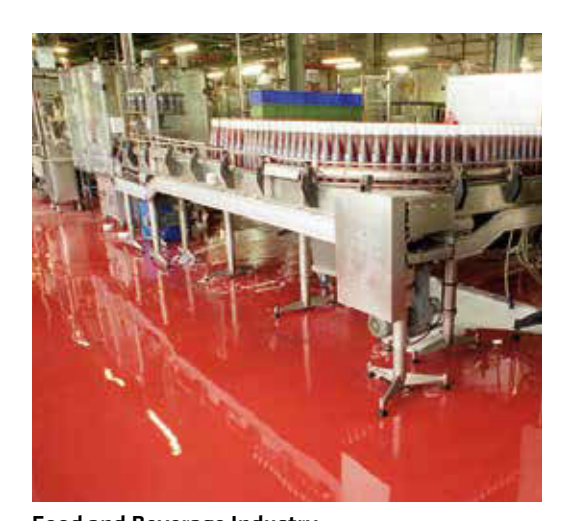
Food and Beverage Industry