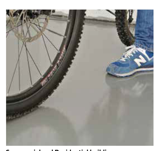
Commercial and Residential buildings