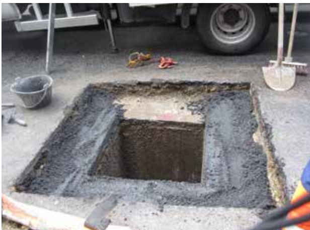
Placing Sika® FastFix-138 TT as a bedding mortar - mixed to a semi-dry consistency. Adjusting the final level of the manhole frame.