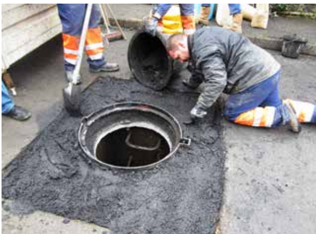
Pouring Sika® FastFix-138 TT to grout the manhole frame in position - mixed to a pourable consistency.