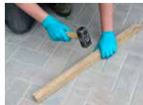
3. Compact well into the joints using a suitable Wacker-Plate, or simply use a wooden level and hammer.