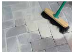
2. Brush into the joints