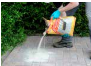
1. Pour out small amounts of Sika® FastFix-131 powder