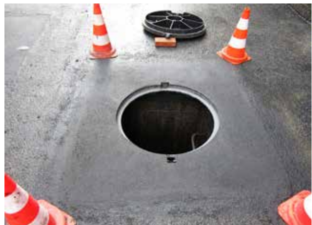
Finishing of Sika® FastFix-138 TT before it hardens.