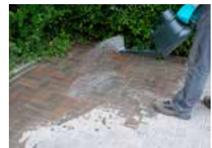
4. Saturate the surface and the joints with water using a hose or watering can.