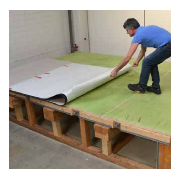
Fold half of the membrane back. Cut release-liner over the width of the membrane.