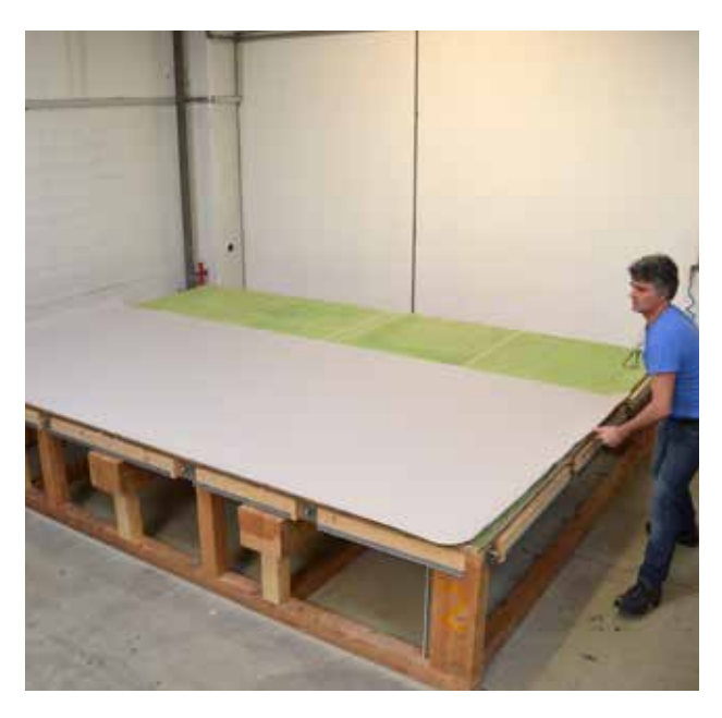
Membrane is rolled out and aligned in the correct position with the correct overlaps.