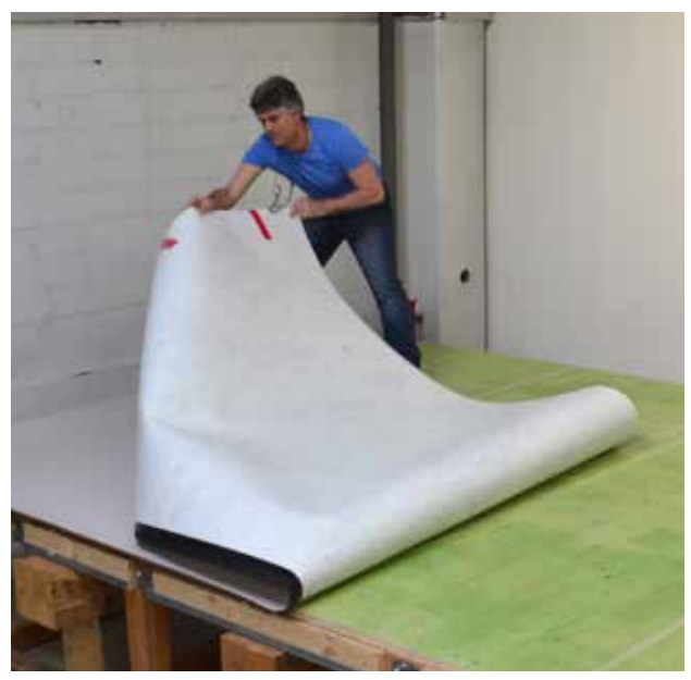
Remove release liner on half of the membrane by drawing off. Adhere the membrane to the substrate. We recommend using a brush or a putty knife to prevent blisters. Execute the same procedure on the other half of the membrane.