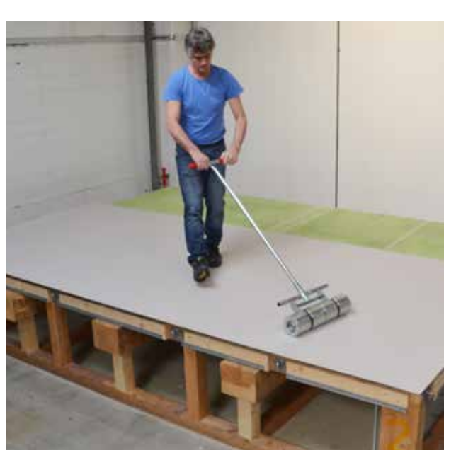
After the membrane is applied, use a water-filled or steel roller to press down the membrane properly to the substrate.