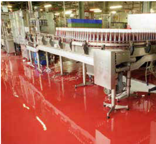
Food and Beverage Industry