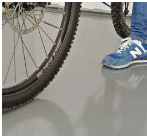
Commercial and Residential buildings