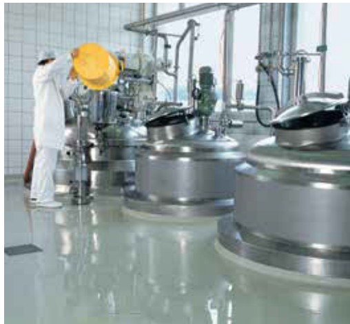
Manufacturing and Process Industry